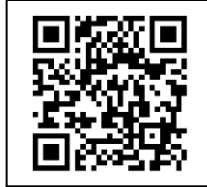
User Manual e-Request

* Note Operation of the Two-way communication system via electronic media and Inventech Connect systems depends on the internet of the trust unitholders, as well as the equipment and/or the program of the equipment. Please use equipment and/or program as follows to use systems.